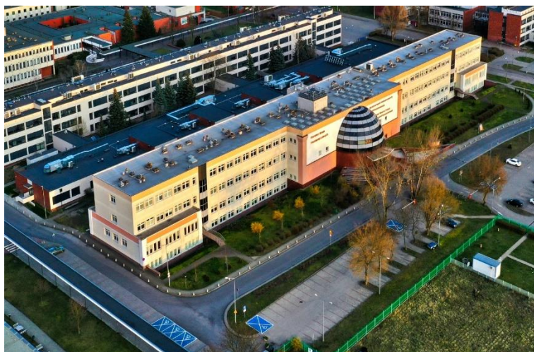
Photo of Conference Venue – Faculty of Biological and Veterinary Sciences, Lwowska 1 Street, Toruń